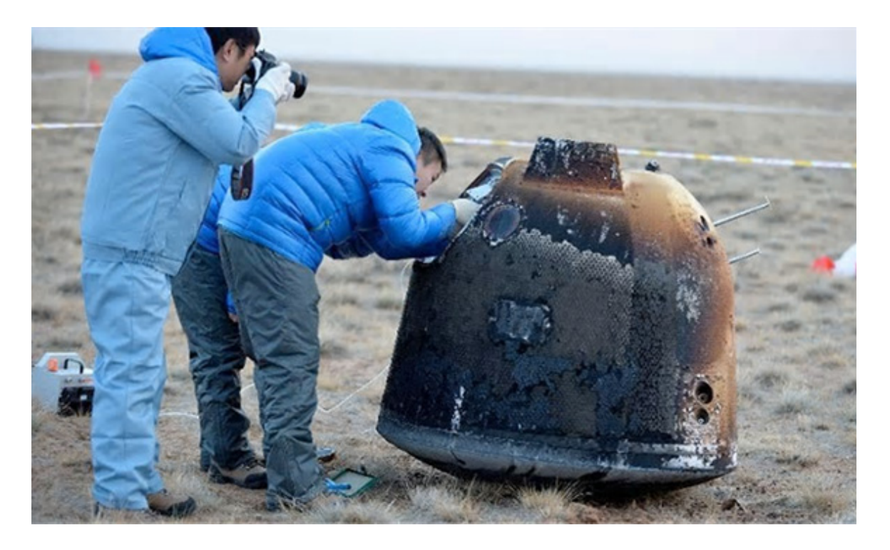
Figure 1. China probe flies around moon.

Journeys including humans to go beyond the earth, to new discoveries and to search for other living areas are right around the corner. Current example for this, Rosetta space duty performed with international cooperation by Europe Space Agency (ESA). Japan's Hayabusa2 space vehicle took on a similar duty and started its journey. USA continues to work on to send catch-bring meteors duty to space. China and India,